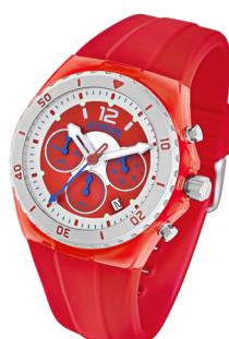
AION AIOH3806-201 290€ / $390