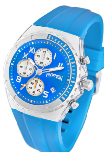
KRONOS KROH3805-367 280€ / $390