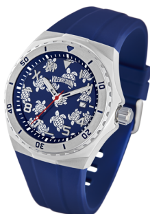
CESIUM CSIH3839-390 220€ / $290