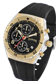
KRONOS KROH3803-990 320€ / $445