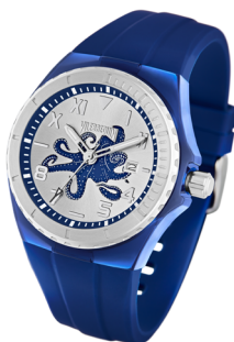
KAIROS KAIH3801-390 230€ / $310