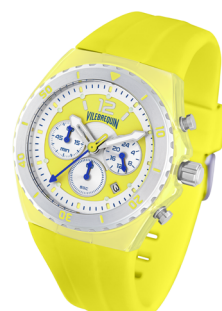
AION AIOH3806-110 290€ / $390