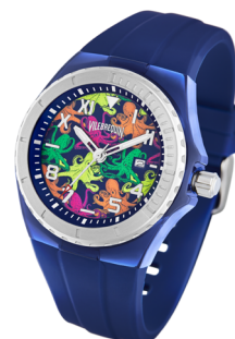
KAIROS KAIH3802-390 230€ / $310