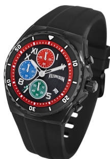
KRONOS KROH3804-990 320€ / $445