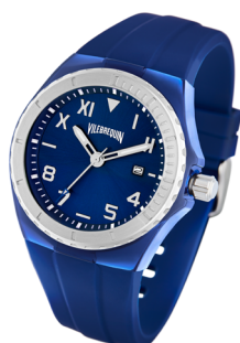
KAIROS KAIH3800-390 230€ / $310