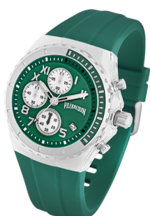
KRONOS KROH3805-467 280€ / $390